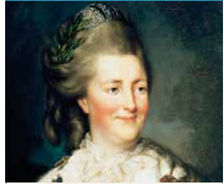
Catherine the Great 1729–1796

The daughter of a minor German prince, Catherine was 15 when she was handed over to marry the Grand Duke Peter, heir to the Russian throne.