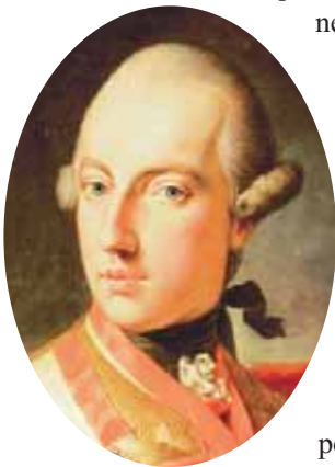
▲ Joseph II

Serfdom was a system in which peasants were forced to live and work on a landowner's estate.