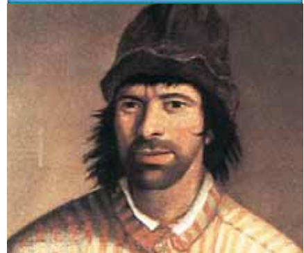
Peter the Great 1672–1725

Peter the Great had the mind of a genius, the body of a giant, and the ferocious temper of a bear. He was so strong that he was known to take a heavy silver plate and roll it up as if it were a piece of paper. If someone annoyed him, he would knock the offender unconscious.