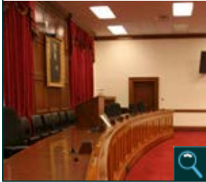
Committee Meeting Room

clerk of the committee places the bill on the committee's legislative calendar. While the bill is in committee, the committee members will seek expert input, hold "mark-up" sessions to make any changes or updates deemed important, and, if necessary, send the bill to a subcommittee for further analysis through research and hearings.